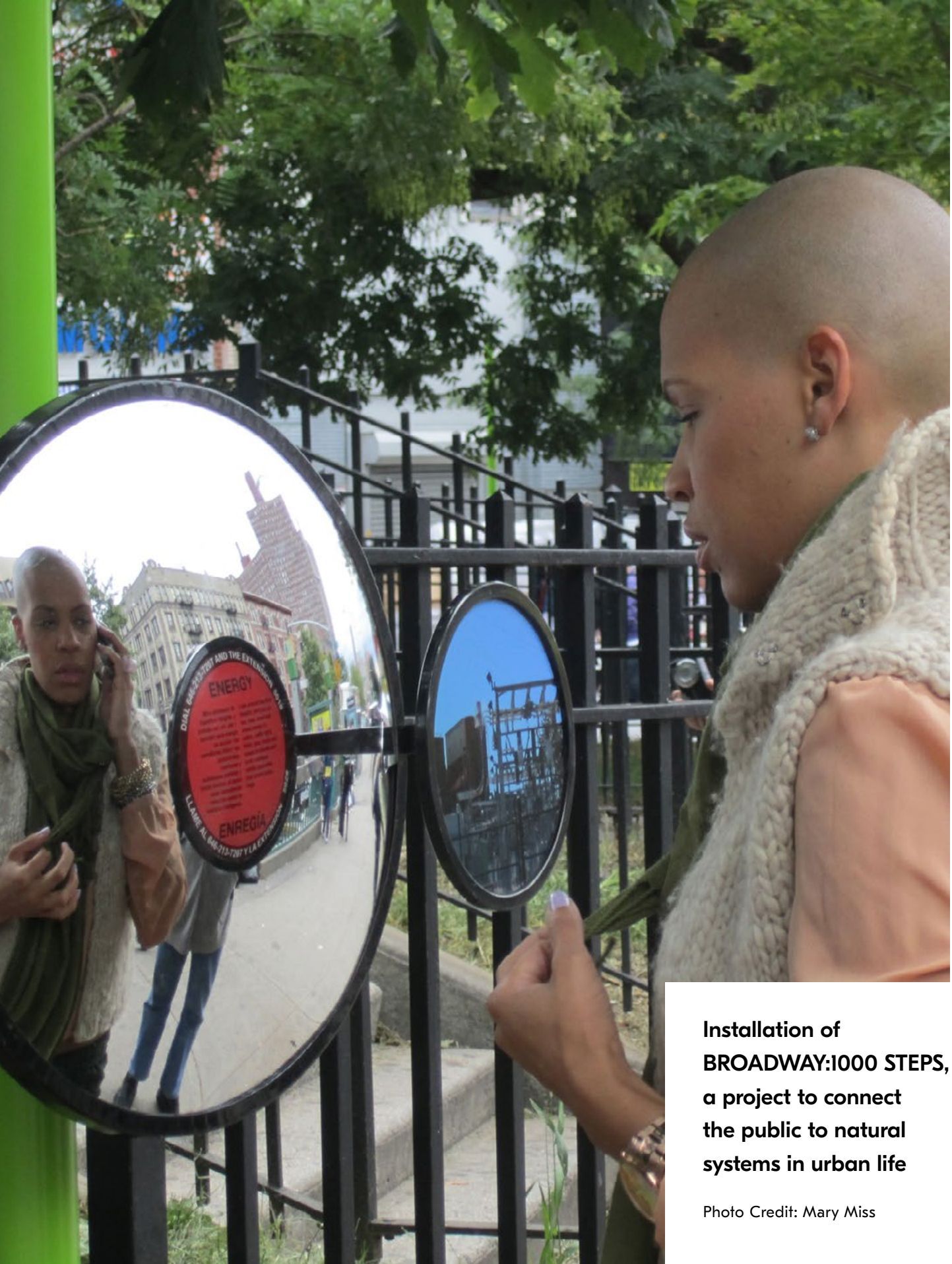
Installation of BROADWAY:1000 STEPS, a project to connect the public to natural systems in urban life