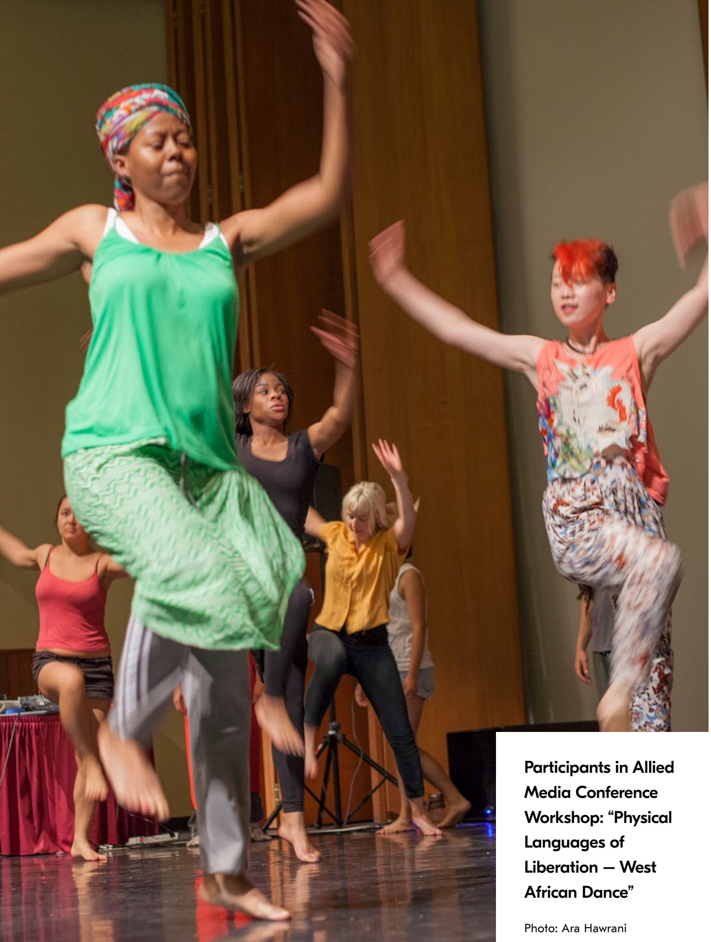
Participants in Allied Media Conference Workshop: “Physical Languages of Liberation — West African Dance”